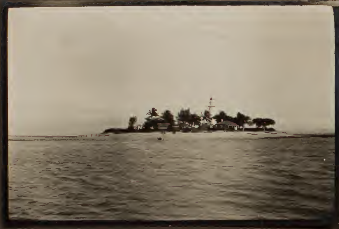
Low Island from Harbour